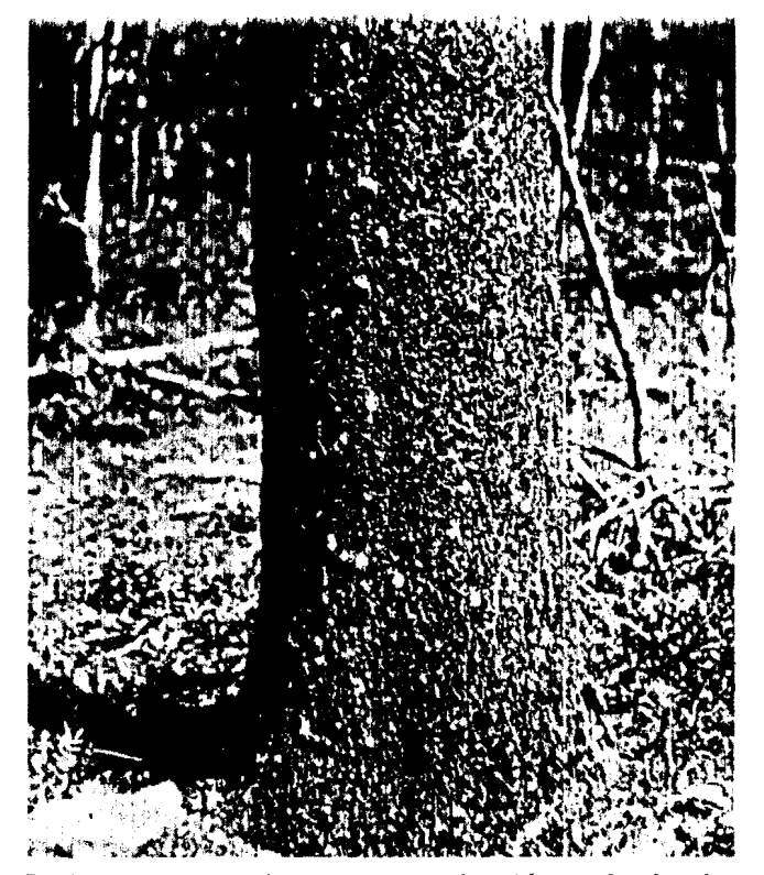
Pitch tubes and sawdust traces provide evidence that beetles have entered trees.

One control possibility is to remove trees before they reach vulnerable sizes, thus eliminating or reducing the potential for beetle epidemics. Because beetle behavior is so closely tied to food supply large diameter trees with thick phloem — logging the proper trees in a stand would reduce the food