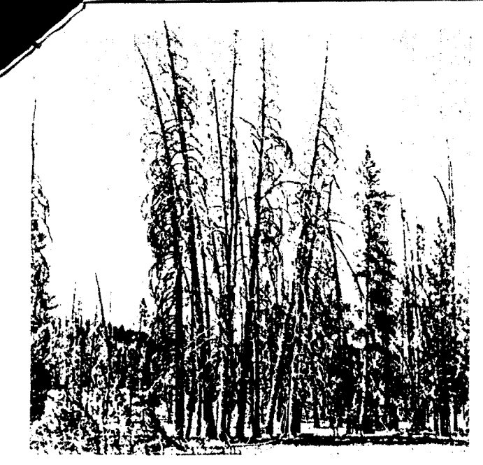
Lodgepole pine devastated by the mountain pine beetle (Teton National Forest, Wyoming).

trees are killed. Unchecked, group infestations can expand with each new beetle generation, and eventually large areas may suffer extreme losses of forest cover.